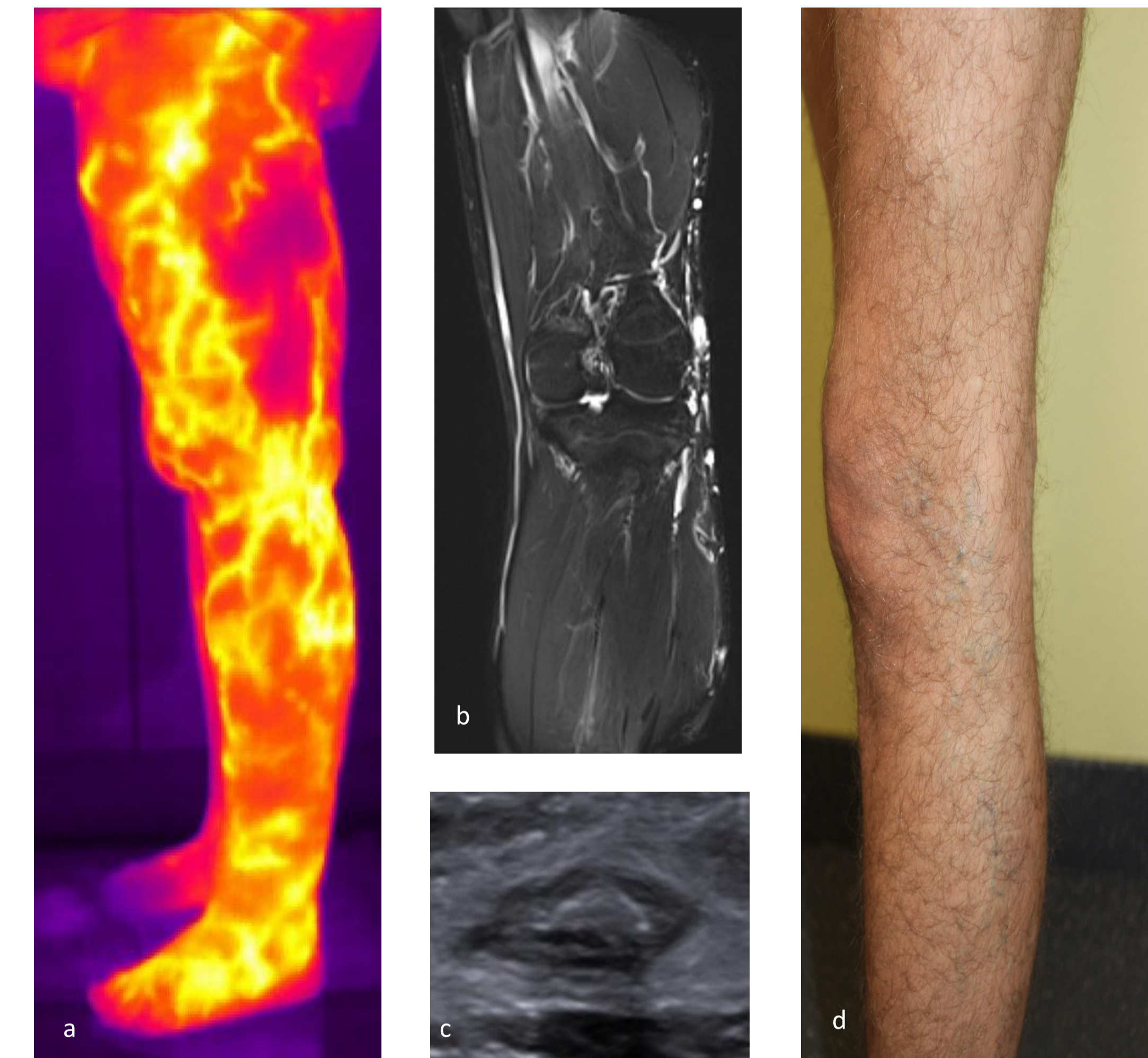
Fig. 2 Thermography of the left lower limb depicting venous malformation (a). MRI before treatment (b). Transverse sonographic image of the marginal vein 3 weeks after treatment with cyanoacrylate. Clinical aspect 28 months after treatment (d)

A 16-year-old man with an incomplete KTS was suffering from swelling and was disturbed by a large marginal vein (diameter 10mm) and multiple protruding tributaries of the left leg. Two treatment sessions were necessary, in each session 4,5ml were applied. The ultrasound controls after 28 months confirmed complete closure of the treated vein segments. Beside reduction of swelling the patient profited from the decrease of the cosmetically disturbing veins.